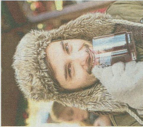
HOT TODDY The après scene

For five-star ski hotels, there's nowhere quite like Courchevel: 19 of them dot the gazillionaire-friendly French resort. But if you're looking for a ski area that can match its broad, steady, ego-boosting pistes and has great food to boot, Canazei, part of Italy's vast Dolomiti Superski area, is the perfect fit. Yes, the alpine