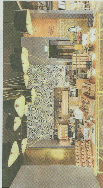
Breakfast at the Hotel Schani, Vienna; top, Turkish spices

Sailing has taught me to take life's challenges as they come